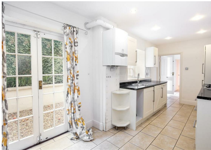
Garden Flat, 13 Vyvyan Terrace, Bristol BS8 3DG Approx. Gross Internal Area 979 Sq Ft - 91 Sq M